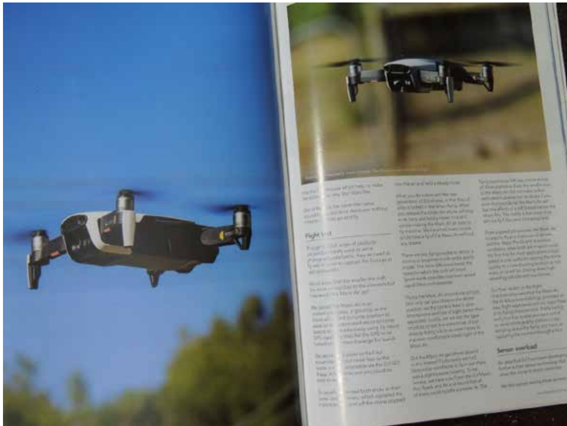
The current multi rotor interest (aka incorrectly called 'drones') is well catered for with reviews of the latest models and articles on the races.

My contact is oilyhand@bigpond.net.au if you have the need and my name is Brian Winch.