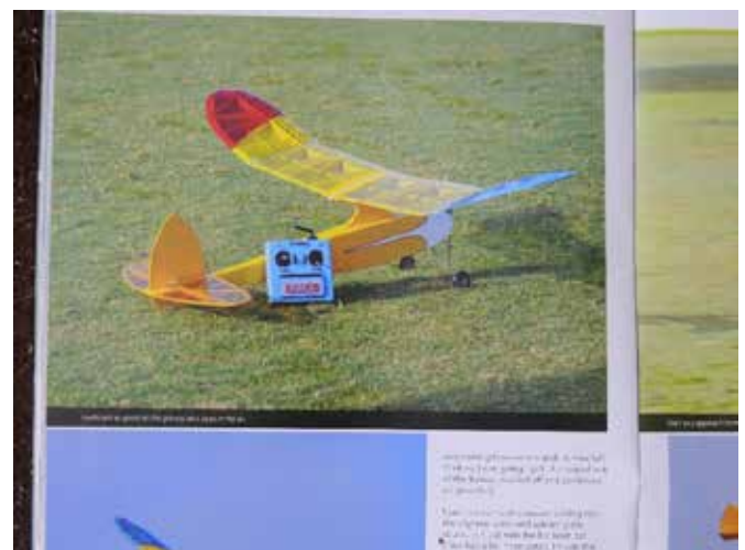
Another example of good photographic reproduction in the magazine and an example of the topic range.