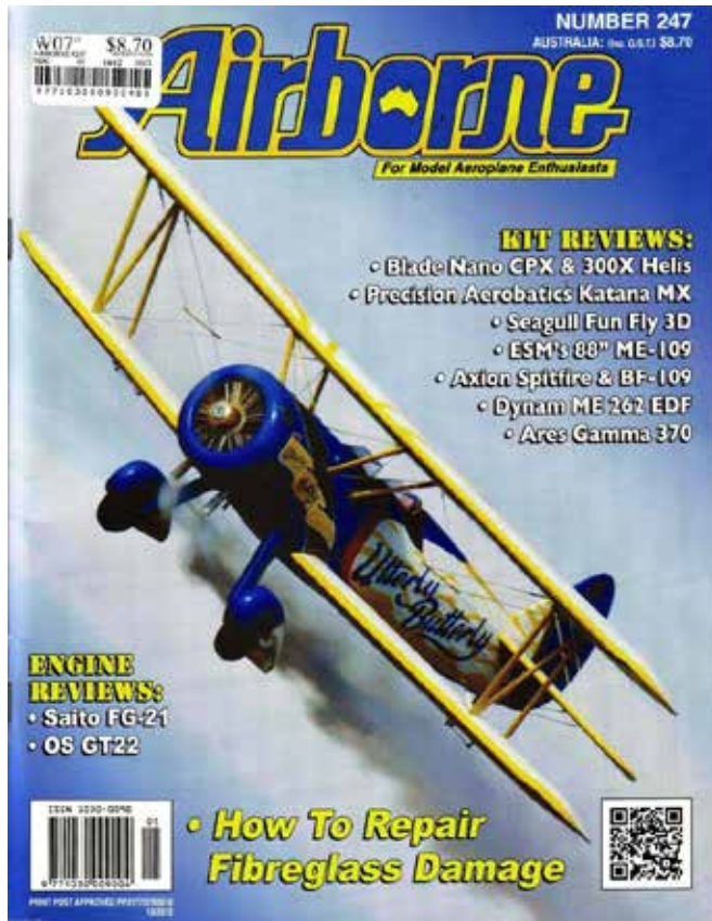
The last issue of Airborne – good for many years, tapered off a bit in the run down.