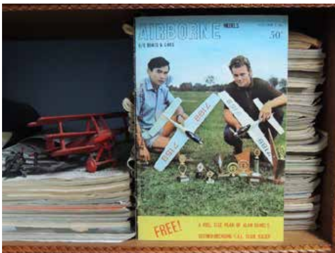
Where it all began –AIRBORNE Vol. 1 – Number 1. Note the slightly different name to later issues.