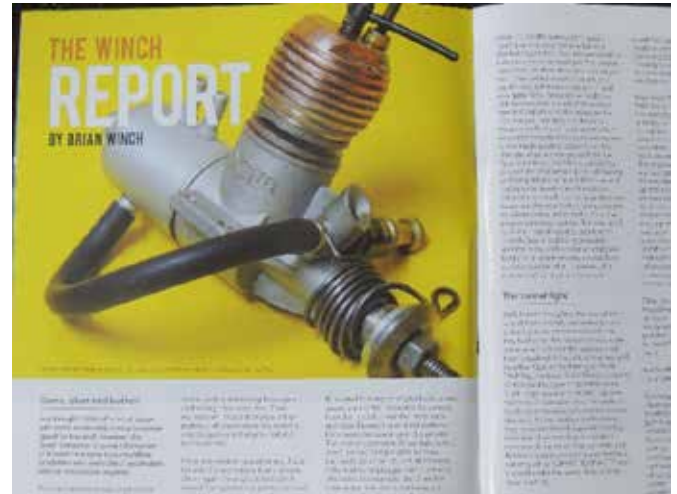
One example of the photo quality reproduction as the header for my WINCH REPORT articles.