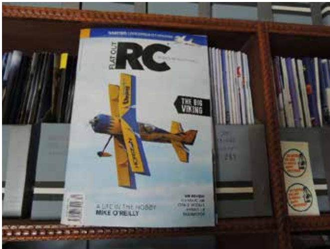
The new 'kid' on the block deserves a place in every modeller's library and is great for 'loobrary' reading.

(not much money in it so far) and the 5th edition is now in production.