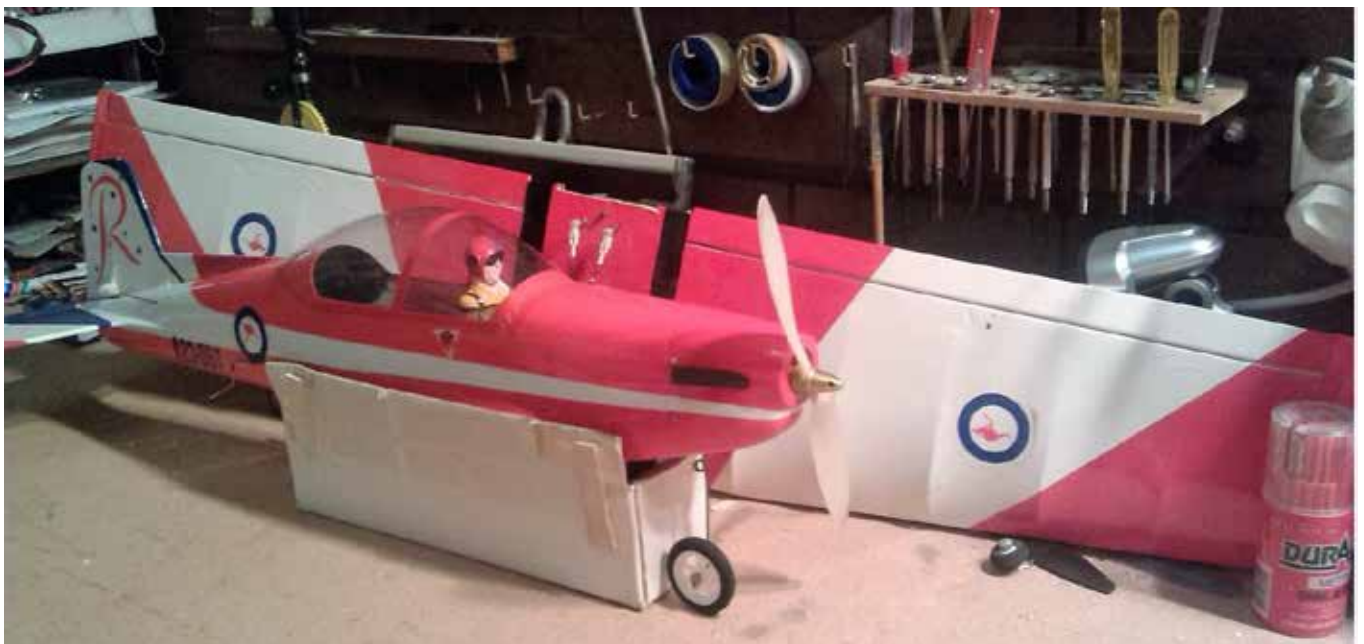
Electric Roulette, Wingspan 960mm, Length 710mm, 1x battery 11.1v, 2040mah, No receiver $60.00