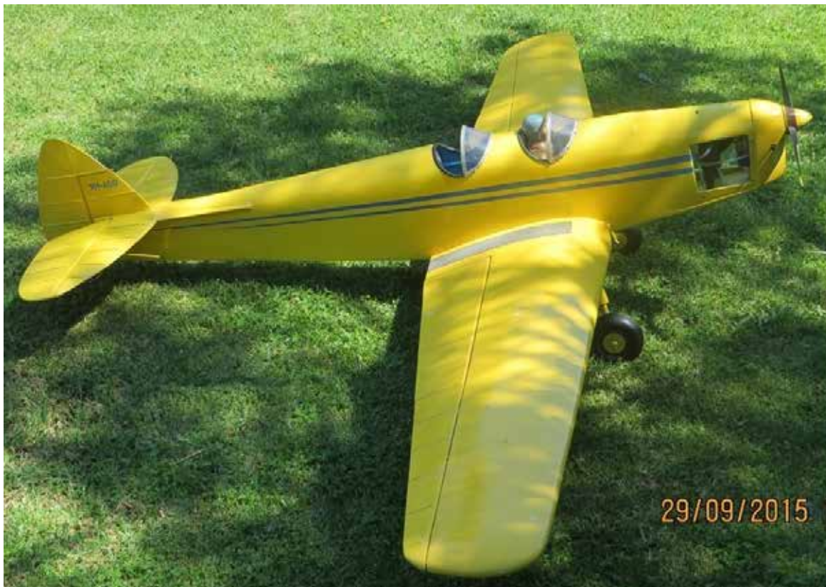
DH Moth Minor, Wingspan 2400, Length 2400, Engine OS MAX 90 2St, No receiver $400.00