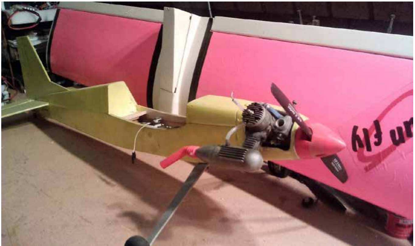
Fun Fly, Wingspan 1380mm, length 1000mm, Engine OS MAX 2St, No receiver $200.00