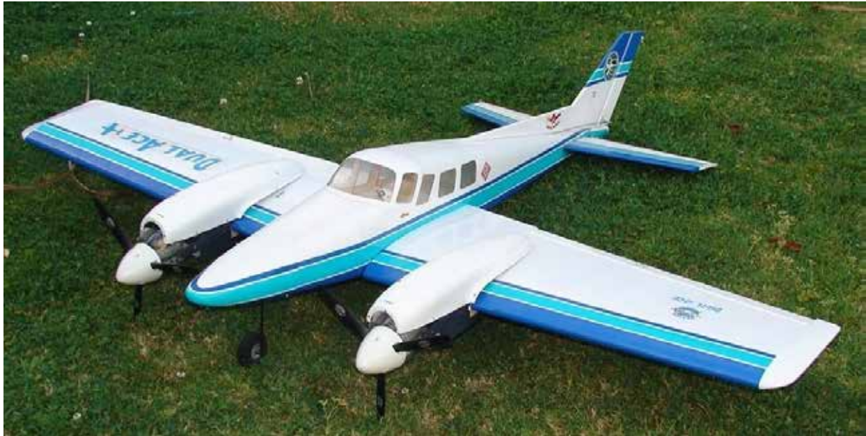
Seagull Dual Ace . Wingspan 1700mm, Length 1450mm, Engines 2 x OS 46AX no receiver, never flown $400.00