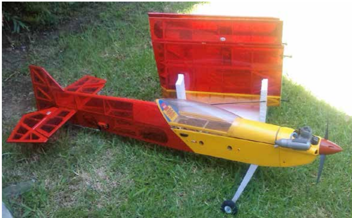
Aerobatic plane, Wingspan 1190mm, Length 1300mm, Engine OS 2St $300.00