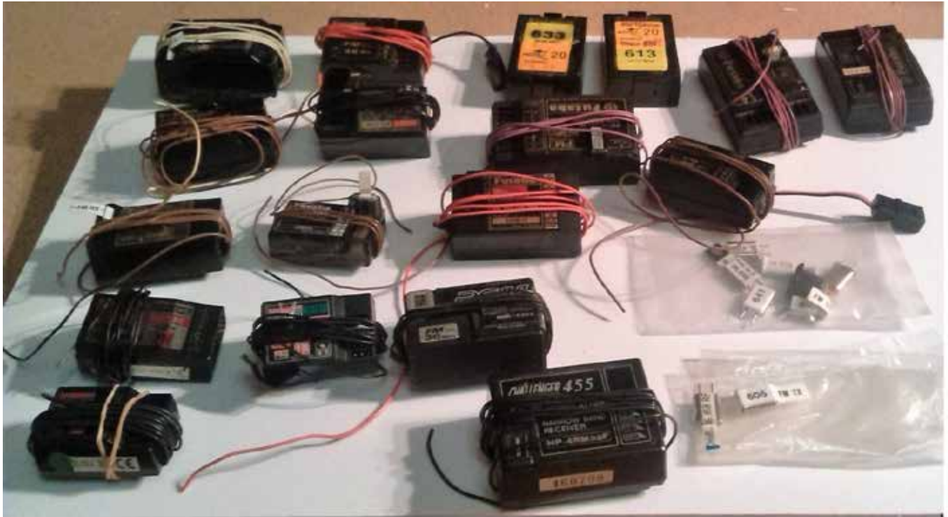
36mhz receivers, 3 Hitec, 11 futaba, 2 others, 2 on 29mhz, 9 crystals on diff freq. $150.00

36MHz receivers – 3 x Hitec, 11 x Futaba, 2 others. 2 on 29Mhz plus 9 crystals on different frequencies. $150