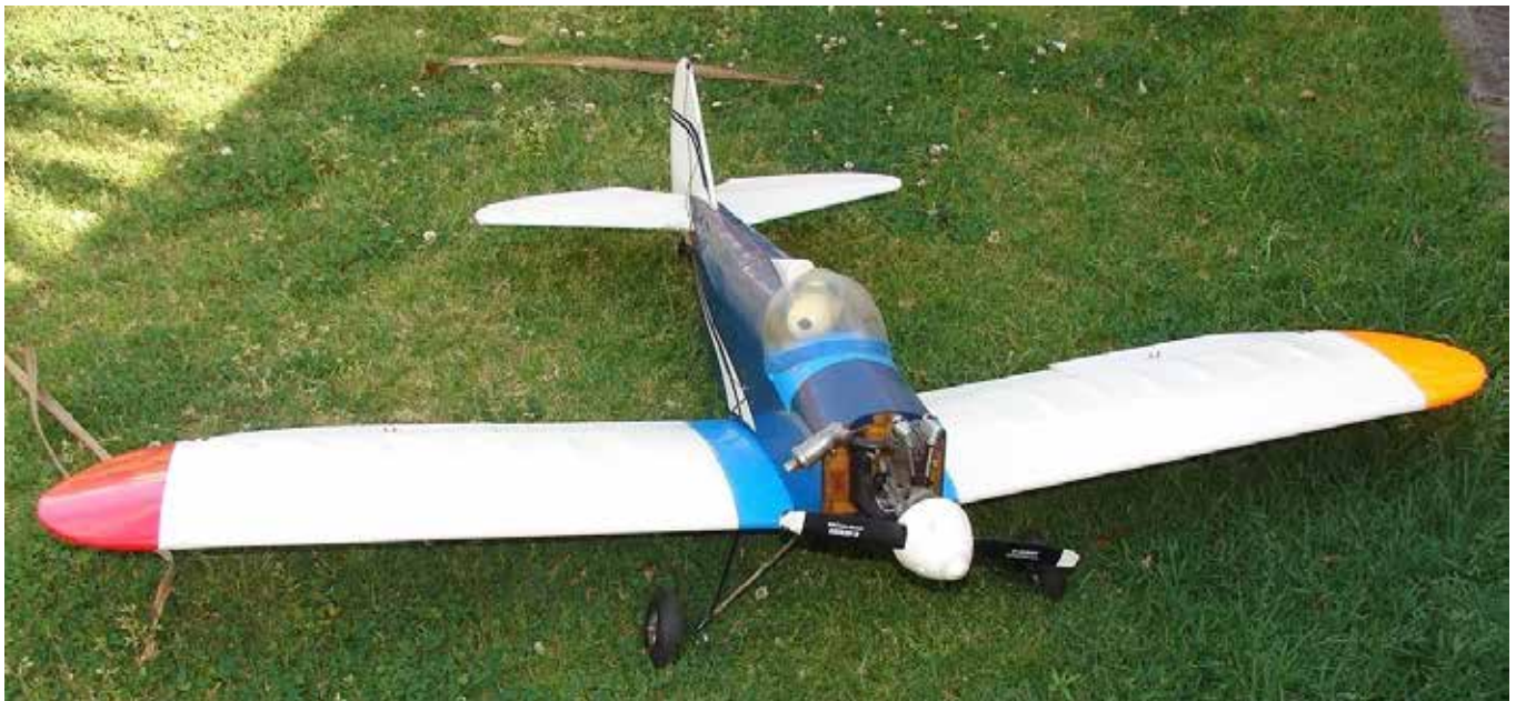
Fly Baby, Wingspan 1170mm, Length 1170mm, Engine Saito FA80 4St. Still on 36MHz $200.00