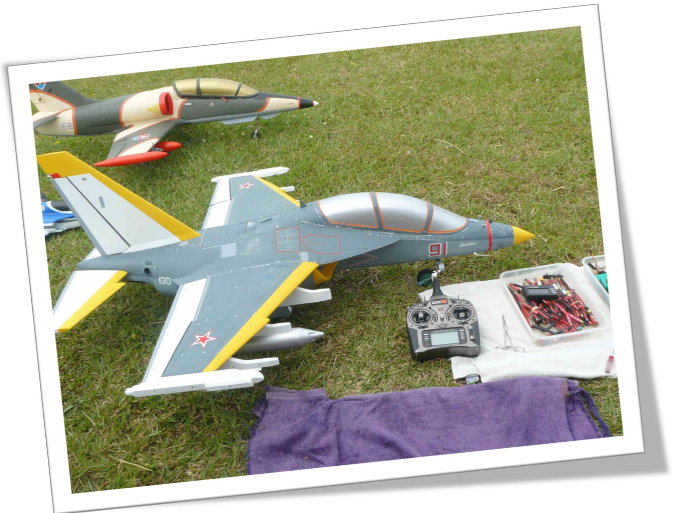
Joseph Frost's latest heavily modified YAK-130. Power is a Stumax 89 mm ducted fan rotated by a 1400 kv. Neu motor on 8S LiPos. Read the full story on Page 11.