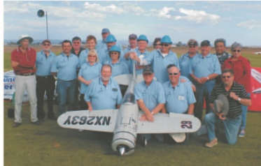
GOLDEN ERA RADIAL up to 100cc and Gee Bee Y ARF 62cc