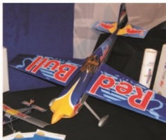
NEW SCALE AERO try your hand at scale racing 1/4 scale ARF 20cc glo or 30cc petrol no retracts