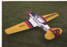
AT-6 TEXAN 20cc glo