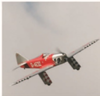
GOLDEN ERA IN-LINE up to 100cc