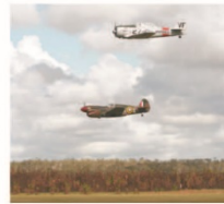
RENO WARBIRDS up to 62cc