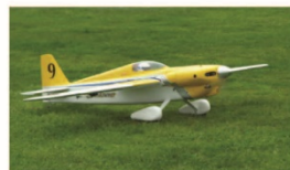
Formula 1 up to 56 cc