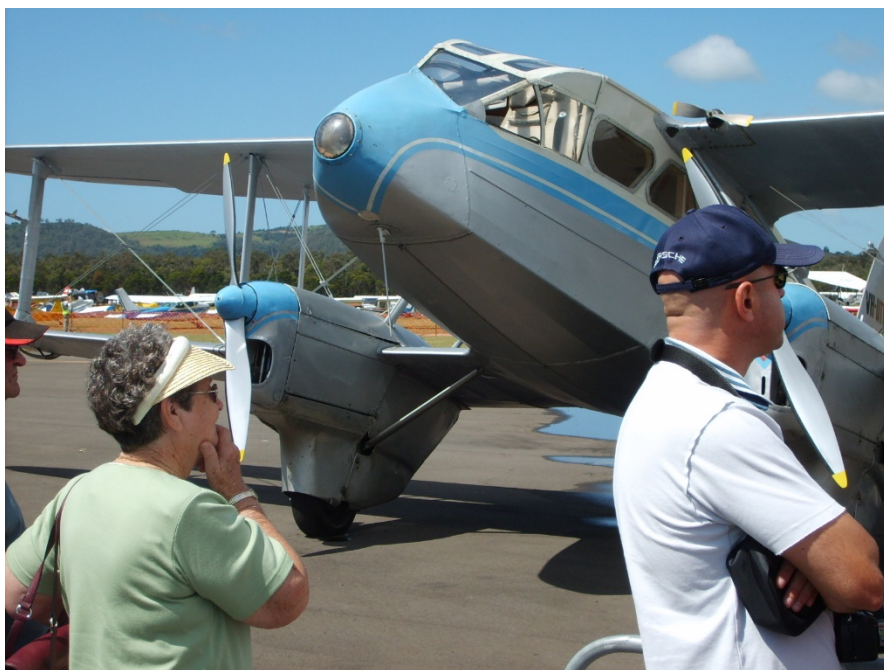
VH-UTV de Havilland D.H.89A Dragon Rapide seen at Wings over the 'Gong