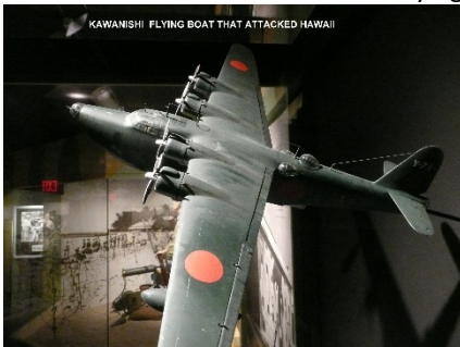
KAWANISHI FLYING BOAT THAT ATTACKED HAWAII

And then the Pearl Harbour attack that I am sure you all know about....but did you know there was a second attack on March 4th 1942? Two Kawanishi Flying