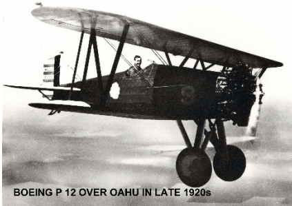
BOEING P 12 OVER OAHU IN LATE 1920s

The 1930s saw Amelia Earhart (Lockheed Vega) and Charles Kingsford-Smith (Lockheed Altair) arrive and depart. Military aircraft continued to build in numbers and capability.