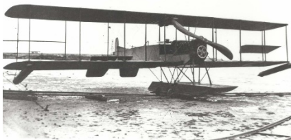
CURTIS MODEL G TRACTOR SCOUT AT FORT KAMEHAMEHA

He was ordered to cease flying by the end of the year as the aircraft could not handle the trade winds! His operation was from Pearl Harbour. This was part of a contingent of 14 Army personnel who set up a training school. It was disbanded after 4 months.