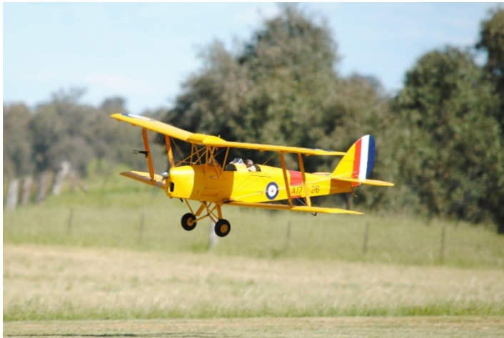
Invitational Scale Classic Downunder, Cootamundra

So you will see the icons or buttons on their own on badges for hats, across the website where the articles will talk about one or more disciplines, and trophies. You will see the united logo on clothing and banners, press releases, the website and other primary places. Welcome to the start of the new brand.