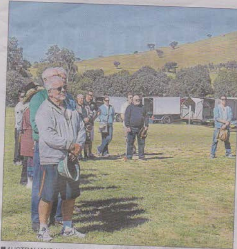
■ AUSTRALIANS ALL: On Friday Scale Aircraft Society members and onlookers gathered at the State Flying Field in Cootamundra during the opening ceremony of the Invitational Scale Classic Down Under. Pilots came from far and wide to take part in the event hailing from Brisbane, Newcastle, Sydney, Melbourne, Launceston, Hobart and Gladstone.