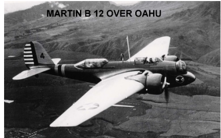
MARTIN B 12 OVER OAHU

bombs fell harmlessly and the aircraft returned safely to their Marshall Island base.