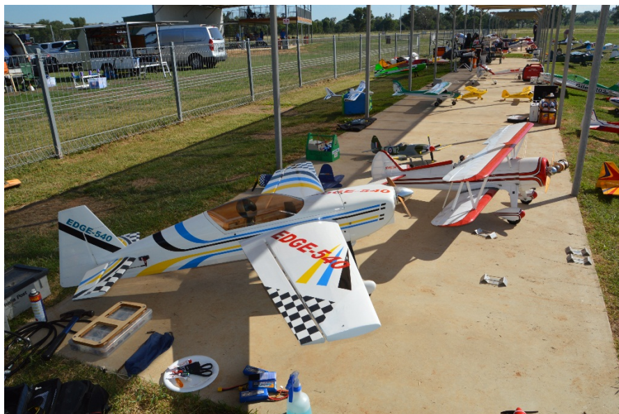
The pits at the Cootamundra Fly In