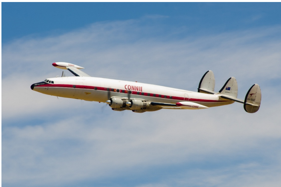
“Connie” flies past at Warbirds Downunder 2013