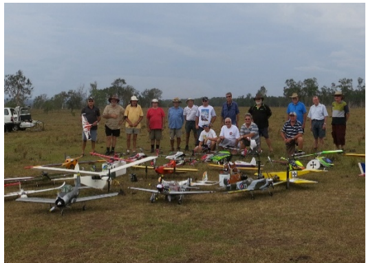
GMAC pilots on our first day at the field

We hope to invite other clubs in our area to a fly in once the new strip is fully grassed. We have provision for Heli's on one side of the club container and fixed wing on the other so everyone is kept happy.