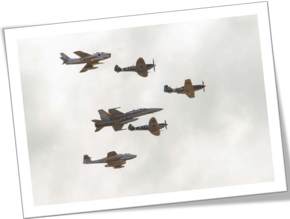
Formation flypast at Warbirds Downunder 2013 recently held at Temora, NSW.