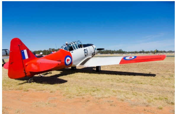
One of the T6 Harvards of the Southern Knights Aerobatic team at Warbirds Downunder 2013