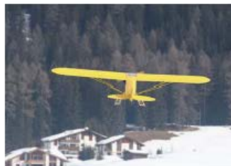
Flying with skis