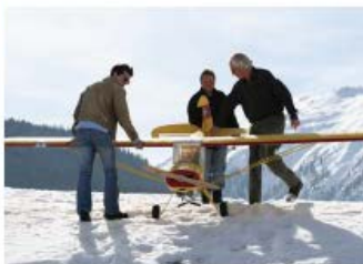
Cold and dry air -16° C flying without gloves

"After seeing your snow-white glider being towed up into the deep blue sky for the first time, you'll be hooked", says one of the pilots and adds, "For us alpine aeromodellers, flying in wintertime has become almost more important than ridge soaring, although we are surrounded by locations with excellent ridge soaring conditions".