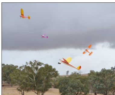
Electric old timers climb out under the threatening Cootamundra sky - Kaylene Ashley photo.