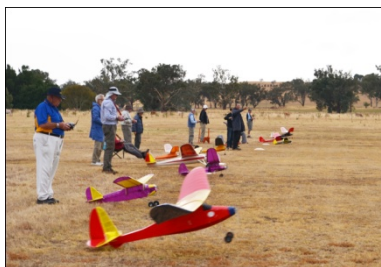
This one shows the take off for a Texaco task at the EOT Nats