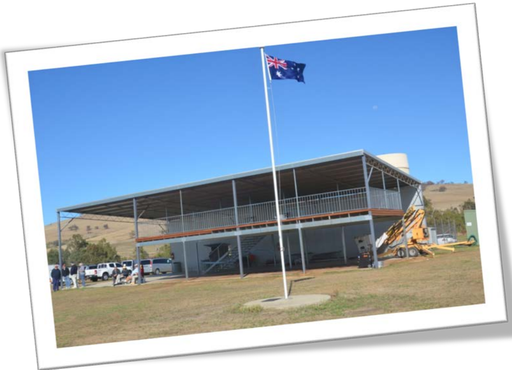
The new mezzanine viewing deck at the Cootamundra State Field.