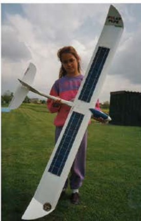
Solar Uhu of Graupner 1991. Kit of a solar powered model aircraft

Editor: Emil Ch. Giezendanner editor@modellflugsport.ch