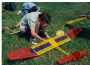
Solar Flight Workshop for young people 1993