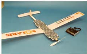
Solar powered model aircraft of Fred Militky 1976