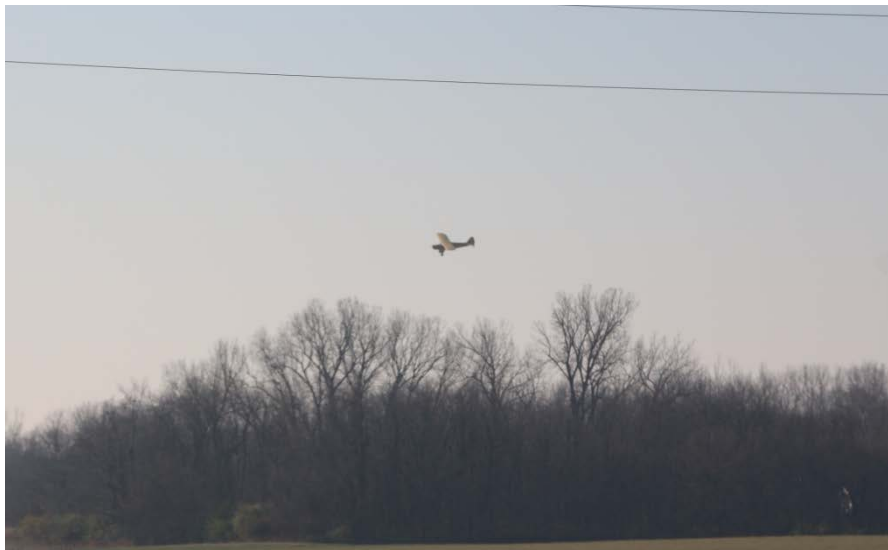
Full sized Piper Cub spotted on approach to the GA airfield located adjacent to the AMA grounds at Muncie.