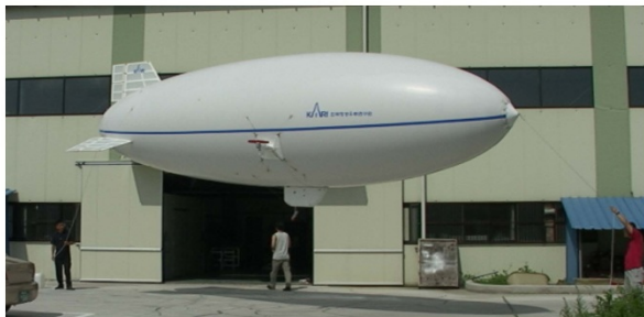
RC scale gas airship (blimp)

So, specific material must be used (mylar®, neoprene, nylon@...), cut in gored and pieces to then be fitted and obtain the nice "cigar" shape you know. Modelers are not fluent with laser or ultrasound gluing and use more simple processes. Add a specific unit to fill the airship with helium, a gondola which contains the batteries, the reception and the propulsion units, rear control surfaces. Optionally add a rear propulsion unit and you are ready to go. Oops! I forgot the photo/video equipment! Not able to build your airship? Many commercial sites will answer your need either sole envelopes or full equipments. Just search "RC airships" on the net. You will get hundreds of proposals... fitting all budgets.