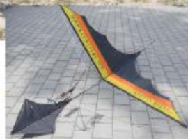
Radio controlled motorised kite

RC flying has also conquered kite flying. Well-known manufacturers of kites offer a large and colourful selection of radio-controlled motorised kites. They are steered by means of a vector-controlled electric motor. This means that when the motor is stopped, the kite can no longer be controlled and is at the mercy of the winds. Motorised RC kites are also very easy to fly and are an impressive and attractive addition to aeromodelling.