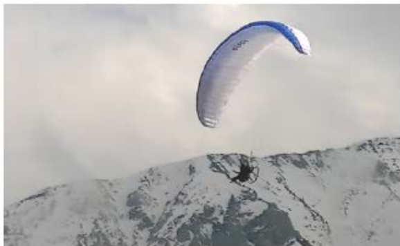
RC paragliders can be taken on walks in the mountains and along the coast