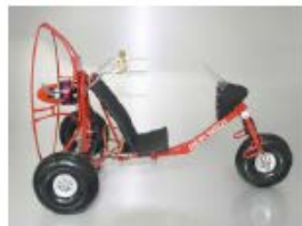
Example of a Gondola or trike to start from the ground

aircraft are capable of long and silent flights in the updraughts over mountains and hills. Some of the dummy pilots control the glider with their arms. To prevent the loss of altitude, the dummy pilot can additionally be equipped with a backpack engine in the form of an electric motor. RC paragliders weigh between two and three kilograms.