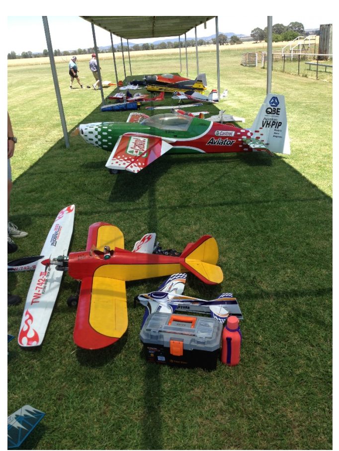
was pulling to go vertical.

After taking off, he took me through some basic manoeuvres and flying techniques, including how to land. After we landed, I couldn't believe what I had just had the opportunity to do. It was an absolutely unbelievable feeling hearing the 250cc engine roar as I