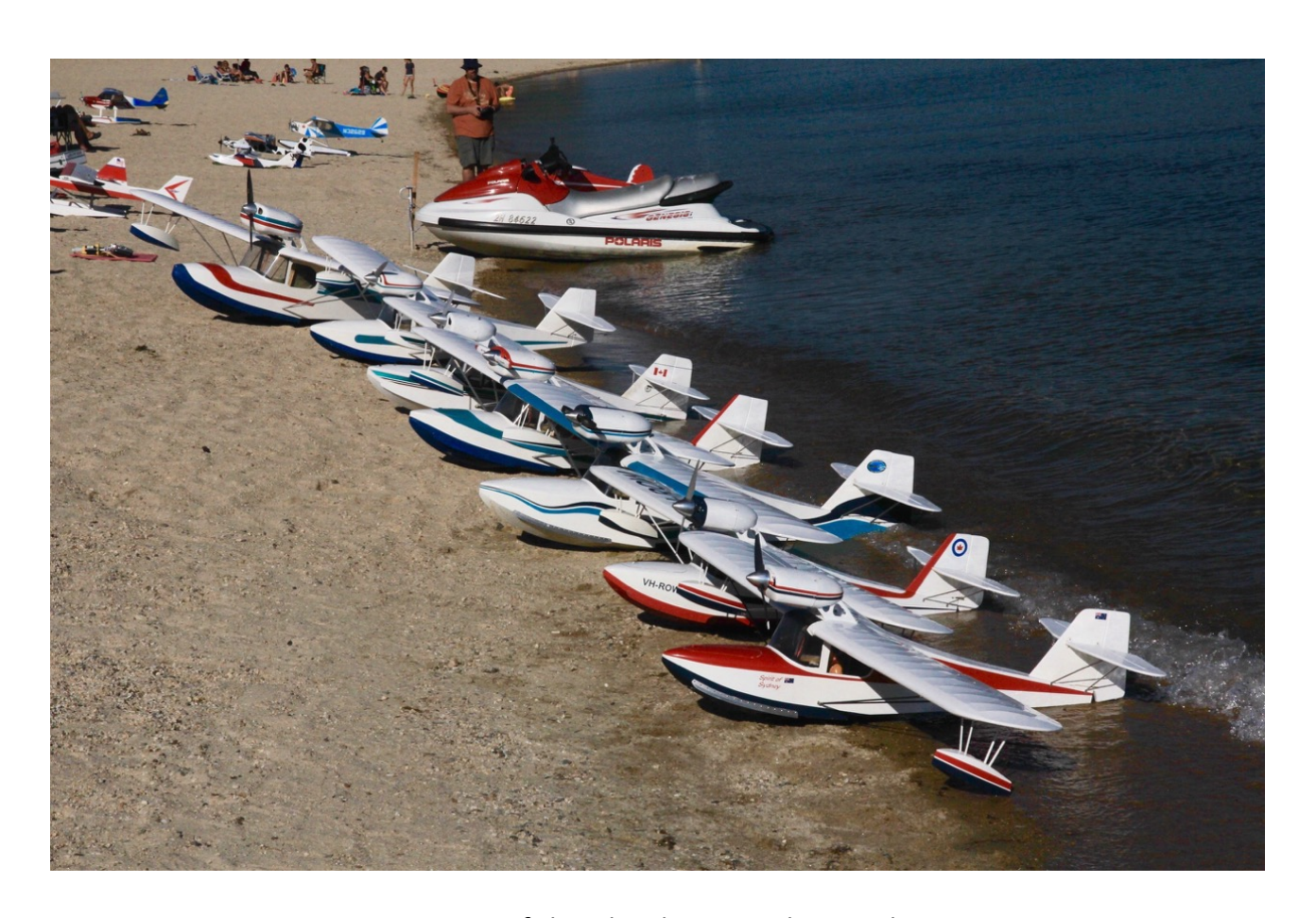
Kingfishers lined up at Sushwap Lake

There being no further business before the meeting, the meeting was declared closed at: 9:12pm