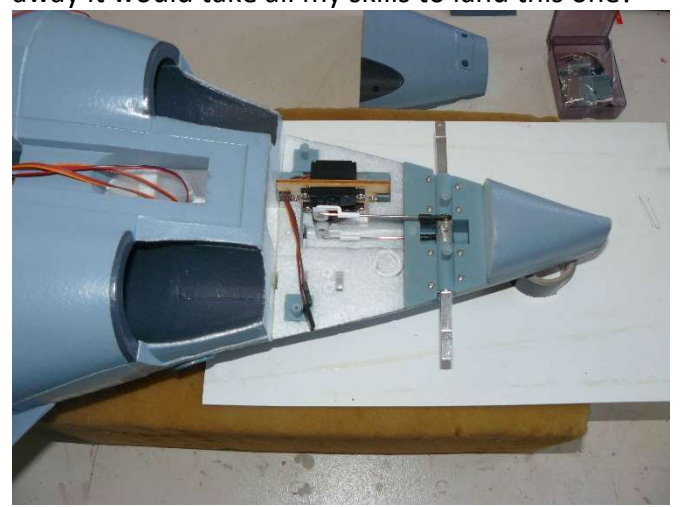
The first lesson on how not to land it occurred on the maiden flight, unfortunatelly touching down at

There were lot of other modifications done including thin trailing edges on all control surfaces, air intake improvements and general strenghtening of the model and the landing gear. At 4.5 kilo AUW it is rather a heavy model for a foamy and with the very scale looking landing gear and all the sequencing gear doors I knew strait away it would take all my skills to land this one!