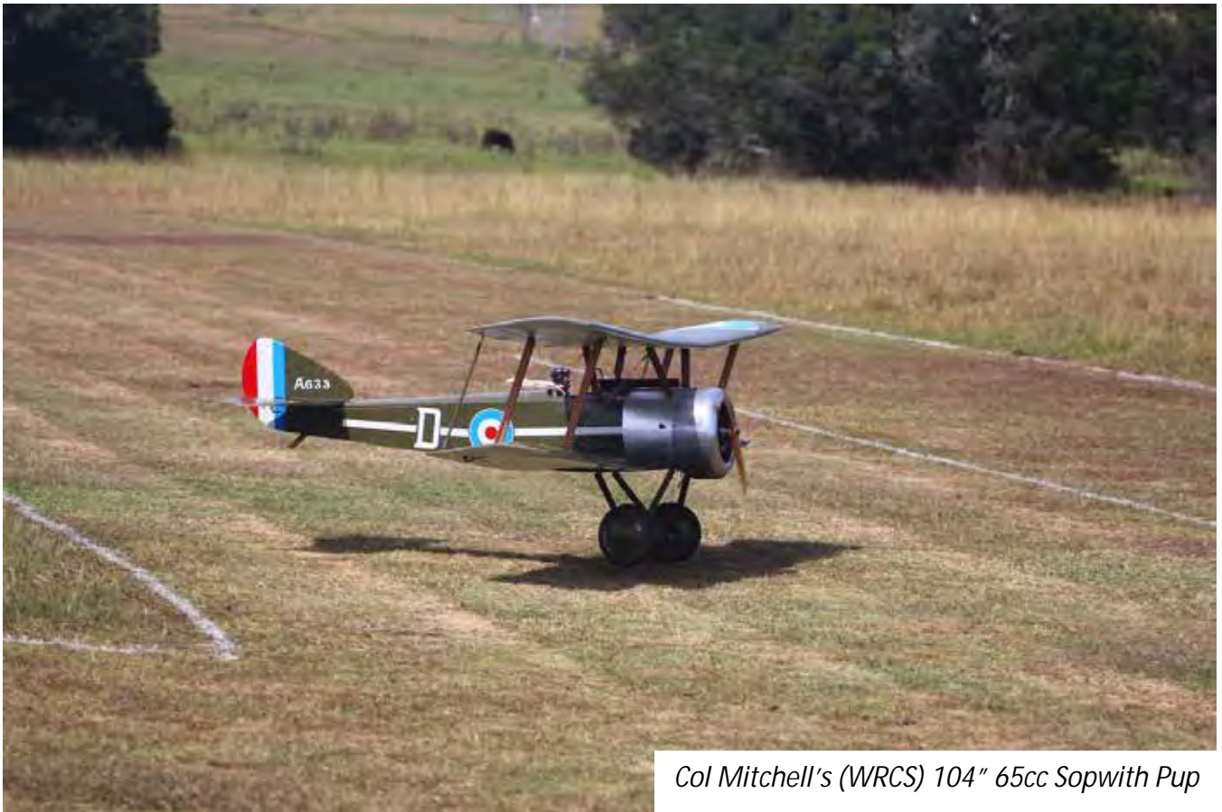
Col Mitchell's (WRCS) 104" 65cc Sopwith Pup