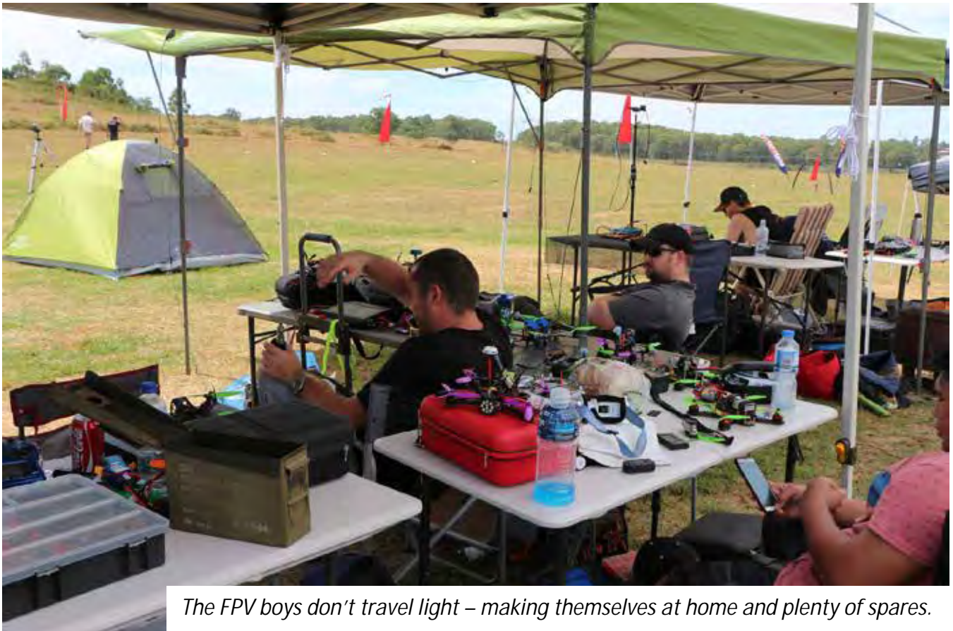
The FPV boys don't travel light – making themselves at home and plenty of spares.