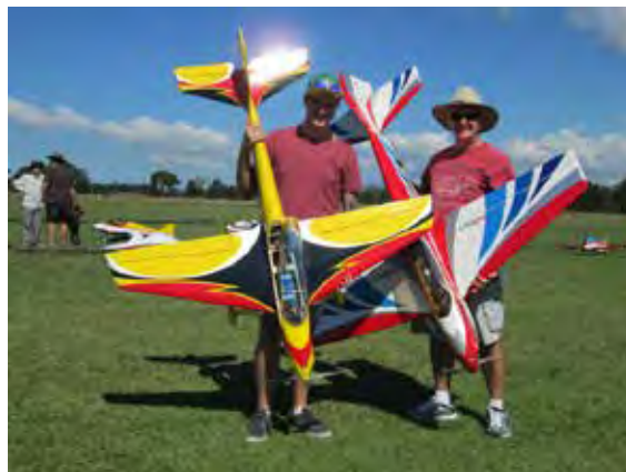
Father and Son Team April 2013 at IMAC