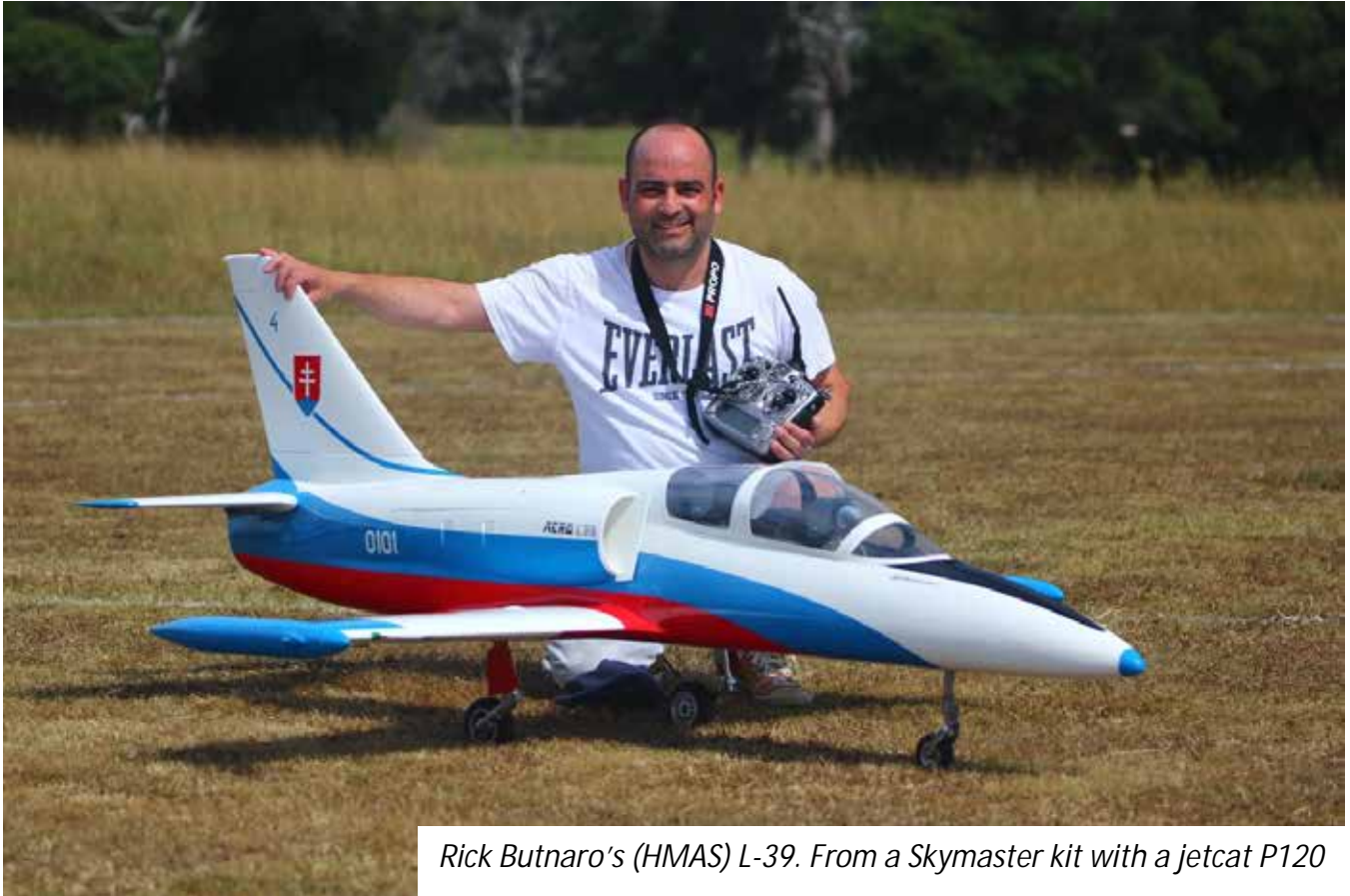
Rick Butnaro's (HMAS) L-39. From a Skymaster kit with a jetcat P120