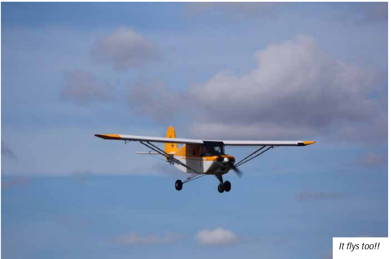
It flies too!!