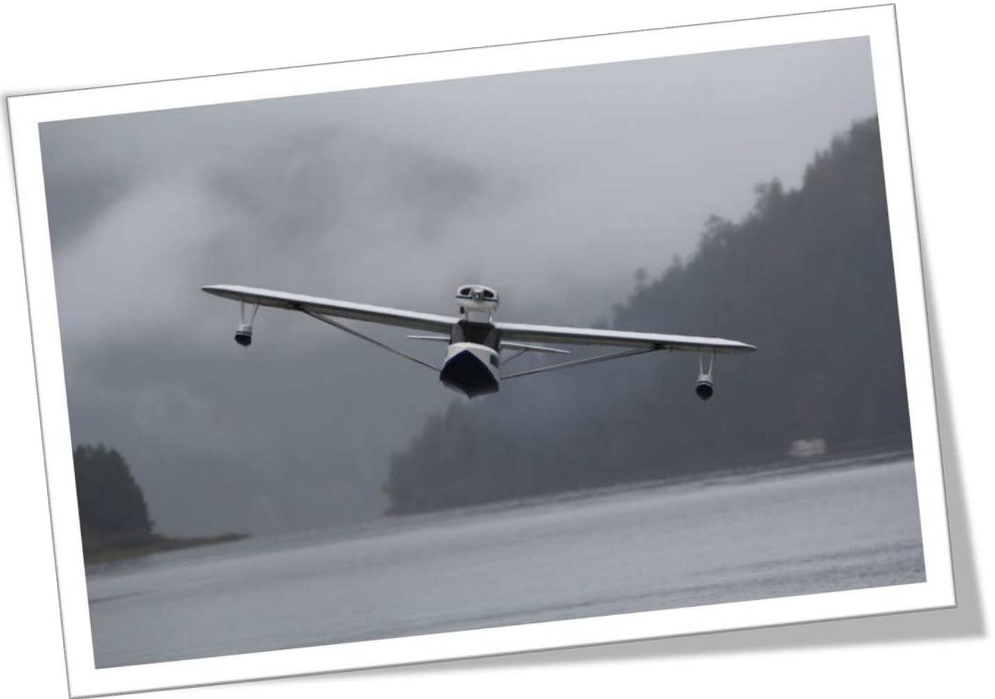
More from Canada this month from the Cowichan Lake on Vancouver Island, Canada in Sep 2015. How real does it look?