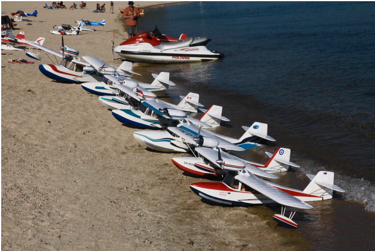
Kingfishers lined up at Sushwap Lake

There being no further business before the meeting, the meeting was declared closed at: 9:12pm