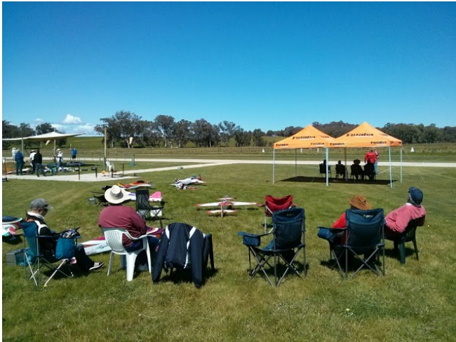
View of flight line at recent APA championships At Twin Cities MAC

For more information contact Felix Nieuwenhuizen, on 0428 880 633, or at felchem@bigpond.com