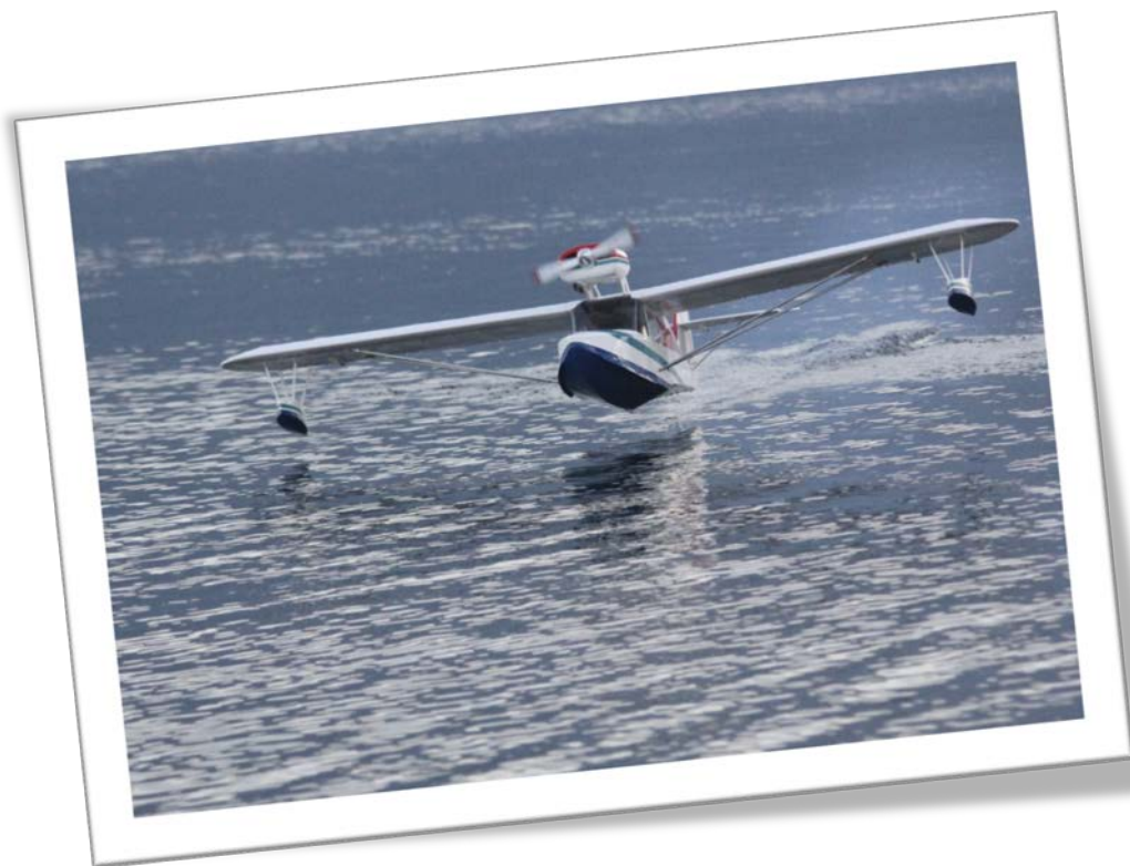
An Australian Anderson Kingfisher takes off at the Sushwap Lake Aeromodellers 2015 Fall Float Fly in British Columbia, Canada – Sep 2015 – more on page 10