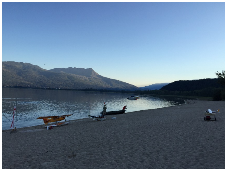
Evening at Shuswap Lake located in British Columbia, Canada – see more on page 10